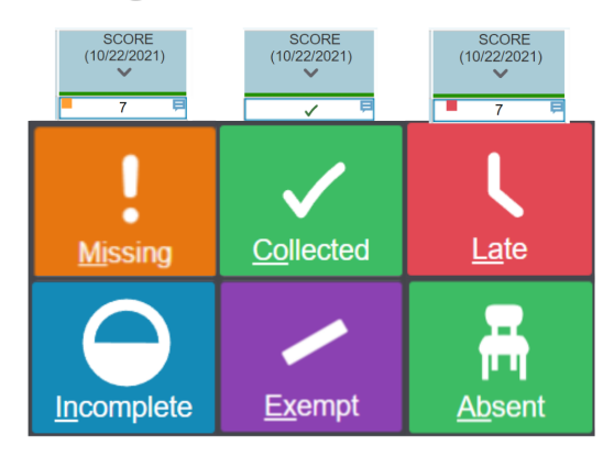
Flags: Use along with or in lieu of an assignment grade. It gives the parent/student extra information to explain grading